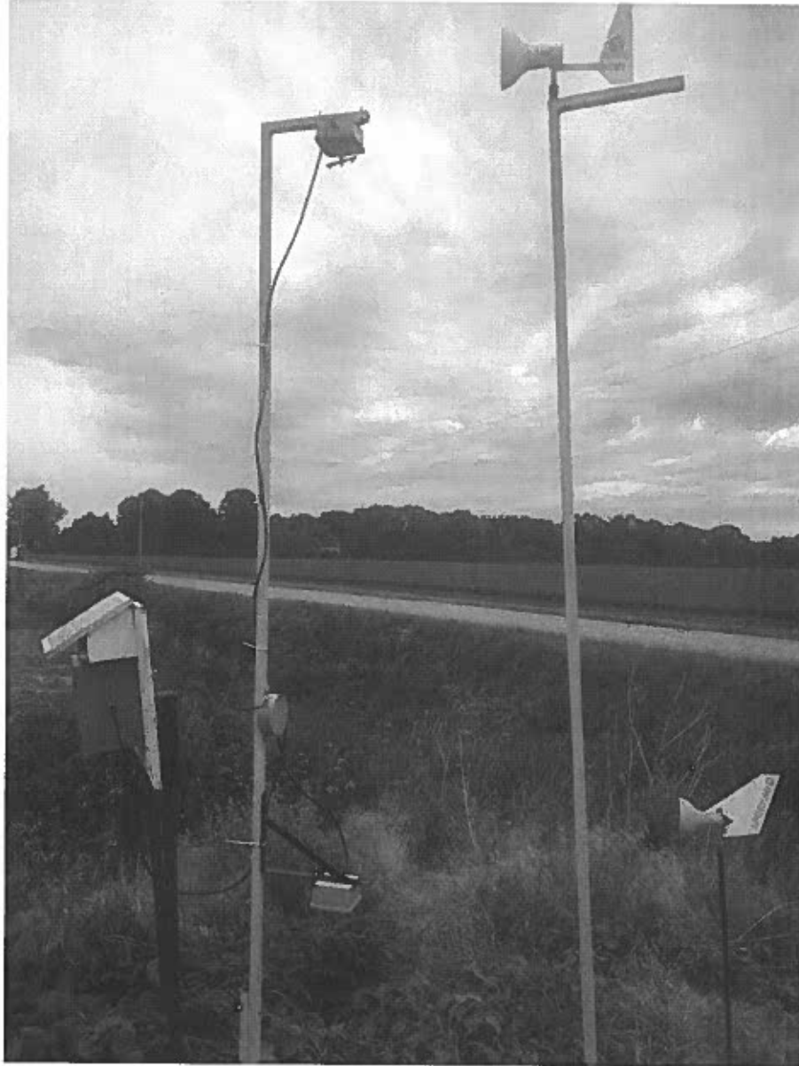
Figure 1. Spornado passive spore trap (right) Rotorod active spore trap (left) placed at 3 m and 1 m above the soil line at the Dover (PI-05) sampling location, 2021.